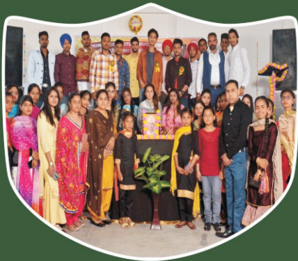
A Tribute To Shaheed Bhagat Singh