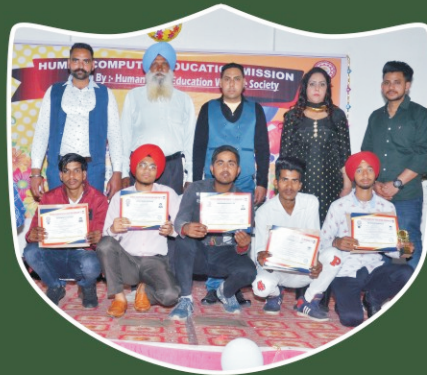
Awarding Certificate to Students