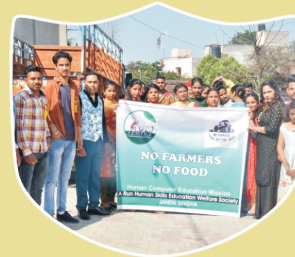
Support To Farmers Rally