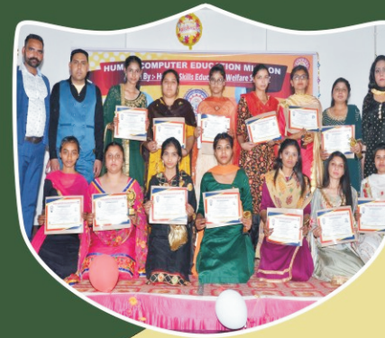
Awarding Certificate to Students