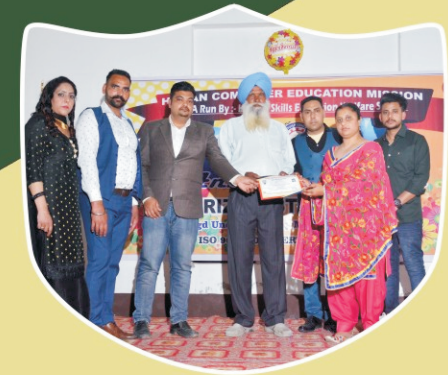
Awarding Certificate to the Topper