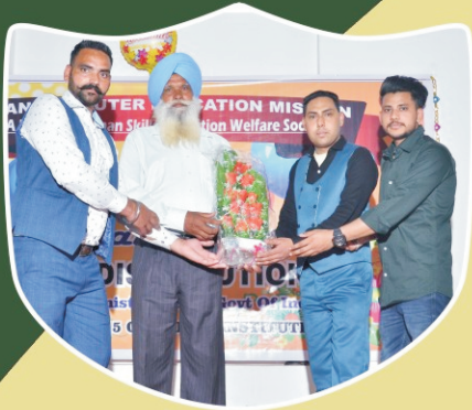
Presenting Bouquet To Chairman of Human Skills Education Welfare Society