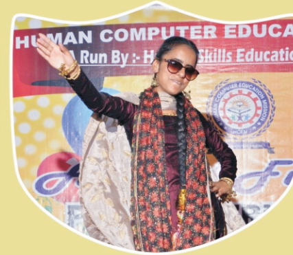
Extra Curricular in Annual Function