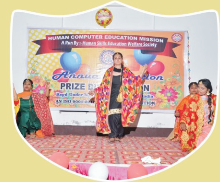
Extra Curricular in Annual Function