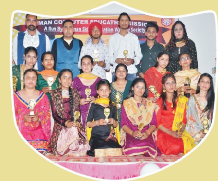
Trophy Awarded To students