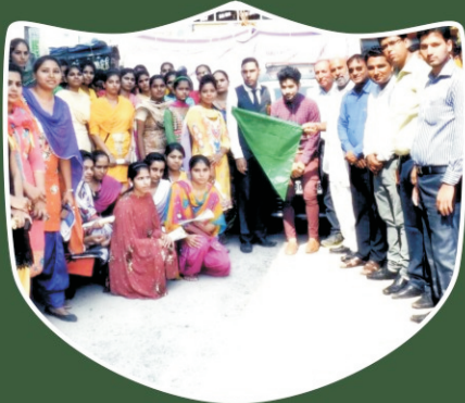
Beti Bacho Bati Parho Abhiyan Rally