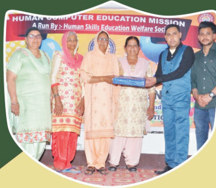
Celebrated Women's Day