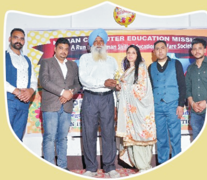
Prize Distribution to the topper